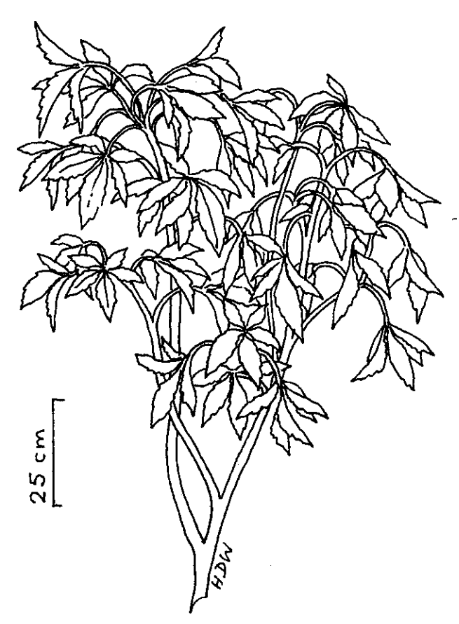
Fig. 1. Sketch of cold-damaged Pseudopanax colensoi, 580m alt., Hinewai Reserve (Hugh Wilson)

Pseudopanax colensoi (orihou or mountain fivefinger) - saplings exposed to south and southwest winds showed deflexed and limp foliage and younger branchlets (Fig. 1). Winter dormancy is by no means complete in this species, just as in many others on Hinewai; still air frost often causes blackening and death of young, partly developed leaves if they are produced in autumn, winter and early spring, but the stem tip eventually simply grows out past the destroyed leaves. July 1995, however, was the first time I had seen fully mature leaves, and stems, affected. Two weeks after the cessation of damaging winds most of the saplings showed complete or nearly complete recovery, with turgidity restored to both stems and leaves. A few saplings still appeared badly wilted 15 days after the weather ameliorated. On days 16 and 17 strong dry NW winds blew, and many saplings that had looked more or less recovered, wilted badly again, suggesting that the damaged leaves' ability to conduct water and/or control transpiration was still seriously impaired.