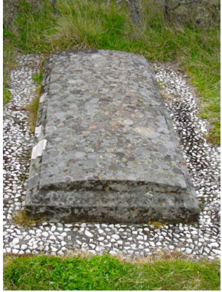
Fig. 2 Andrew Sinclair's gravestone with its lichen mosaic covering.

I have just received your note and am very grateful to you for your kind offer to arrange my dear Uncle's Botanical specimens. They are principally Microscopic drawings over which he spent many of his mornings but to what purpose he intended them I do not know.