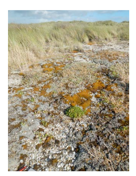
Fig. 3 A view of the sand dune system at Fortrose Spit showing pearlfruit in the centre.

We are grateful to both Lynne Huggins and Brian Rance of the Invercargill office of the Department of Conservation, Southland Conservancy for assistance with identification and field observations.