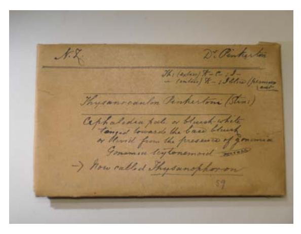
Fig. 1 . Stirton's packet of Thysanophoron pinkertoni (GLAM)

I have not yet received the copy of your work on N.Z. grasses. I see in the present packet a considerable number of barks on which grow a Fungus viz. a Nectria. I presume this puzzled you at the time of collecting. Strange to say this fungus has suffered least of all. So far as I have gone there does not appear to be [a] great variety of lichens in the present package. I can recognize at sight many of the commoner species. I presume you had reached an elevation the least prolific or just at the boundary line between the alpine and subalpine. This has to me been the least interesting and in my mountain ascents I now do not botanize at all at such elevations i.e. I hurry over such ground. At