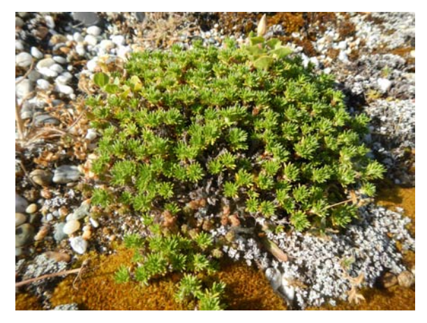
Fig. 2 Pearlfruit growing on the sand plain at Fortrose Spit amongst indigenous plants.

Margyricarpus pinnatus was initially difficult to identify because the flowers are somewhat atypical of Rosaceae in having an inferior ovary, a plumose stigma, two stamens each with a large black-brown anther, and a white fleshy one-seeded fruit. In a phylogenetic analysis of the Rosaceae it is in the tribe Sanguisorbeae where it is sister to Acaena (Potter et al. 2007).